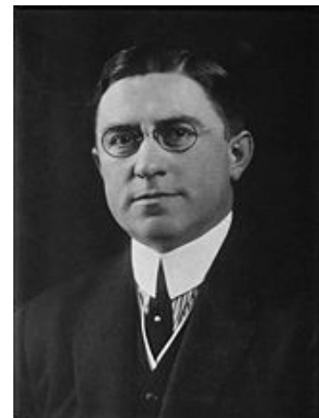
Congressman Louis T. McFadden

"We have in this country one of the most corrupt institutions the world has ever known. I refer to the Federal Reserve Board and the Federal Reserve Banks, hereinafter called the Fed. They are not government institutions. They are private monopolies which prey upon the people of the United States for the benefit of themselves and their foreign and domestic swindlers; rich and predatory moneylenders. "